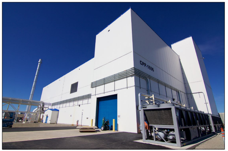
Figure 2: Exterior of the Department of Energy's (DOE) Integrated Waste Treatment Unit at Idaho National Laboratory

Beginning in January 2005, EM managed the development and construction of the IWTU facility as a capital asset project. Once EM determined that construction on the facility was complete in April 2012, the project exited the capital asset oversight process established in DOE Order 413.3B and has since been managed as an operations activity, according to EM Idaho Cleanup Project officials. DOE officials also told us that the IWTU reengineering project has been managed as an operations activity because the facility has been constructed and is now in a period of maintenance and repair. <sup>39</sup> Figure 2 shows a picture of the exterior of the IWTU facility.